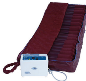
SenTech Stage IV 2000