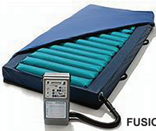
FUSION 2K™ Featuring SelectAir® Therapy