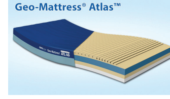
Therapeutic Heavy Duty Solution for Bariatric Care Mattress