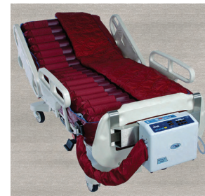
SenTech Stage IV 3000