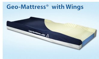
Therapeutic Raised Perimeter Mattress